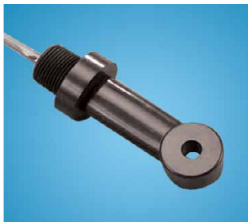
Noryl Toroidal Sensor

Conductivity measurement in aggressive chemical solutions or in water systems containing large amounts of solids, oils, and greases is very maintenance intensive using conventional 2 or 4 electrode sensors. ATi's Model Q46CT employs an inductive (toroidal) sensor that allows measurement in corrosive samples with virtually no maintenance.