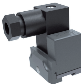
ZE 950 – monostable / ZE 951 – bistable