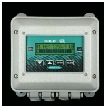
THE SOLO G2 DIGITAL WEIGHT INDICATOR IS SIMPLE TO OPERATE AND INCLUDES 4-20MA OUTPUTS