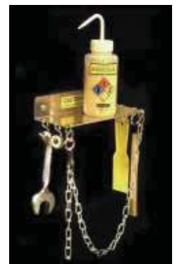
WALL MOUNTED CHAINING BRACKET INCORPORATES TOOL HOOKS TO STORE CYLINDER CHANGE-OUT TOOLS.